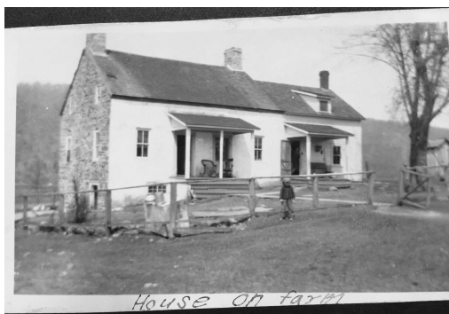
The farm house on West Mill Road - about 1 mile from the main house.