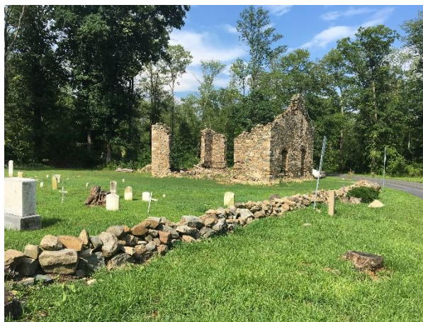
Photos show the condition of the old Swackhamer Church today after removal of trees and brush